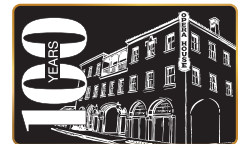
Celebrating 100 years

Refer to the house map with seating section to help you complete your subscription form. If you need any further assistance, please call the Box Office at (941) 328-1300.