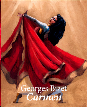
Georges Bizet Carmen

The proceeds from this annual event assist Sarasota Opera, the Youth Opera and aspiring opera singers.