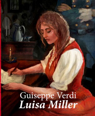
Guiseppe Verdi Luisa Miller