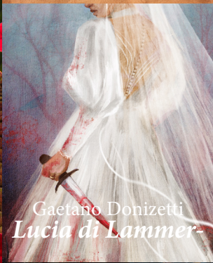
Gaetano Donizetti Lucia di Lammer-